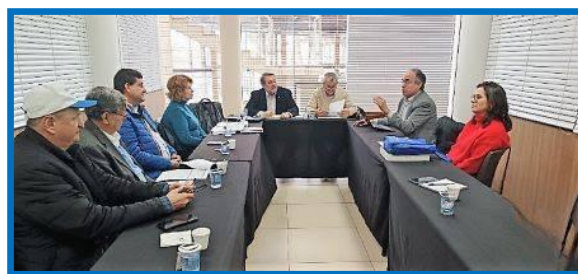
Meeting in Foz do Iguaçu to plan for the important South American Rotary event